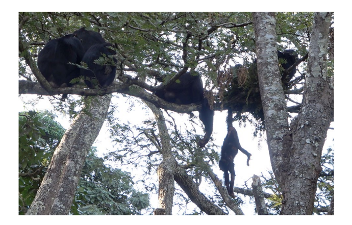
Fig. 2 Adult, adolescent and juvenile males from the attacking party with the infant's carcass shortly after the attack. KIT is in a nest made minutes before by him, holding the infant's carcass (dangling below). WA is showing interest in the carcass but does not take it back from KIT after this point. Screenshot taken from Supplementary video 7 (see Supplementary videos 6 and 7 for nest-making sequence)

09:18 h : The party stopped, and after a quiet pause, began displaying, leaving the carcass and crossing over a