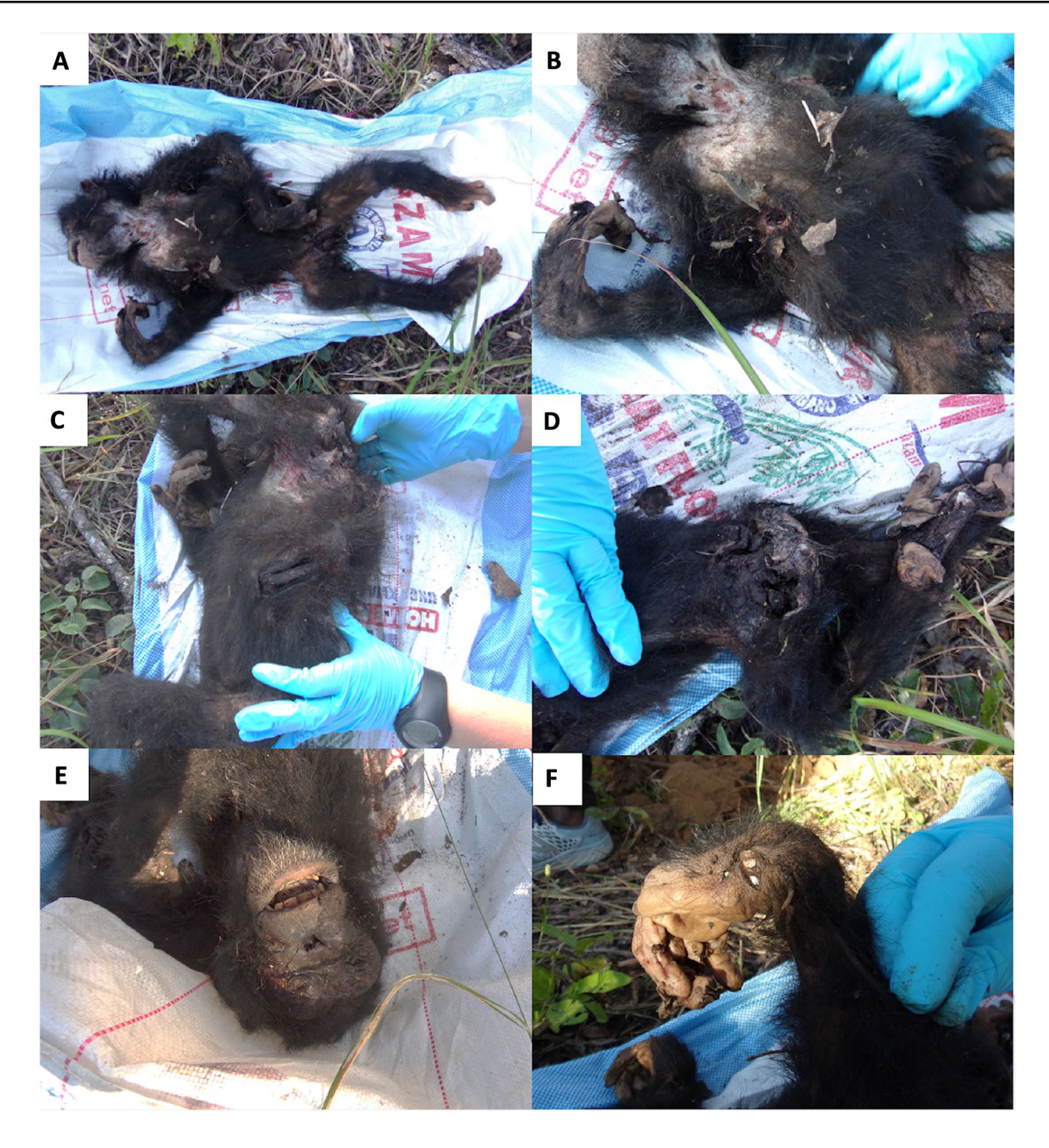
Fig. 3 Post-mortem photos of the injuries incurred by the attacking males on the infant victim during the intercommunity lethal encounter. Injuries incurred include: Broken right femur and tibia (A), removed genitalia (A, B), punctured and lacerated throat and chest

(counter-) attack (e.g., Watts et al. 2002). It is also possible that researcher presence deterred non-habituated chimpanzees from approaching (e.g. Tutin and Fernandez 1991; Bertolani and Boesch 2008).